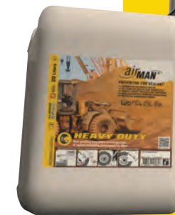
20 L Jug

Contact us: Active Tools (Europe) GmbH Oerlinghauser Straße 65, 32107 Bad Salzufen, Germany T.: +49 (0) 5222 944 97-0