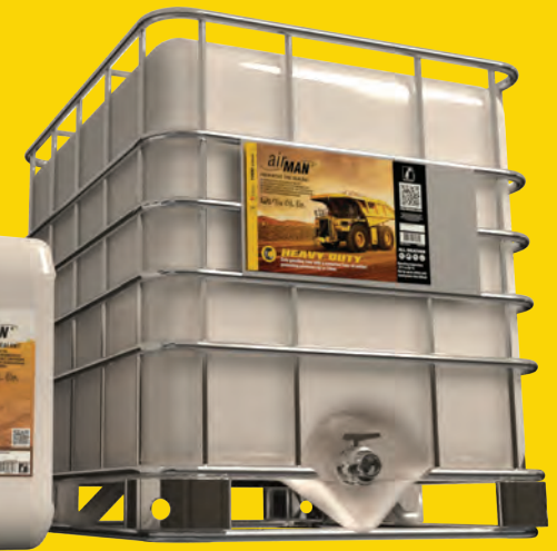
1000 L IBC Tank